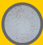
No tea fed